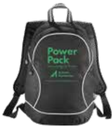
AOII-funded backpack from the National Backpack Program

ARTHRITIS: $683,218 Arthritis programs and research initiatives funded for 2018-2019 thanks to donor support and AOII chapter events.